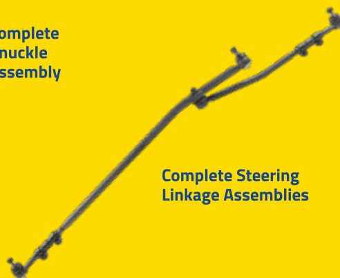
Complete Steering Linkage Assemblies