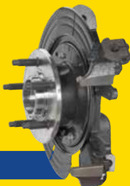
Complete Knuckle Assembly