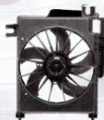
Condenser Fan Assembly

Conveniently notched to install around existing A/C lines